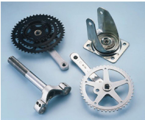
Above: actual example of processing 加工實例如上圖